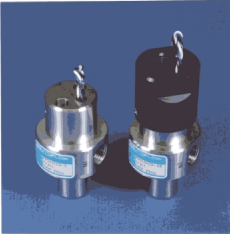
FS5700 Series Flow Switch - High Flow available with 1/4 and 1/2 NPT Connections with optional Explosion Proof Cap

Adjustable Liquid Series - Range 0.5 l/min to 18 lpm