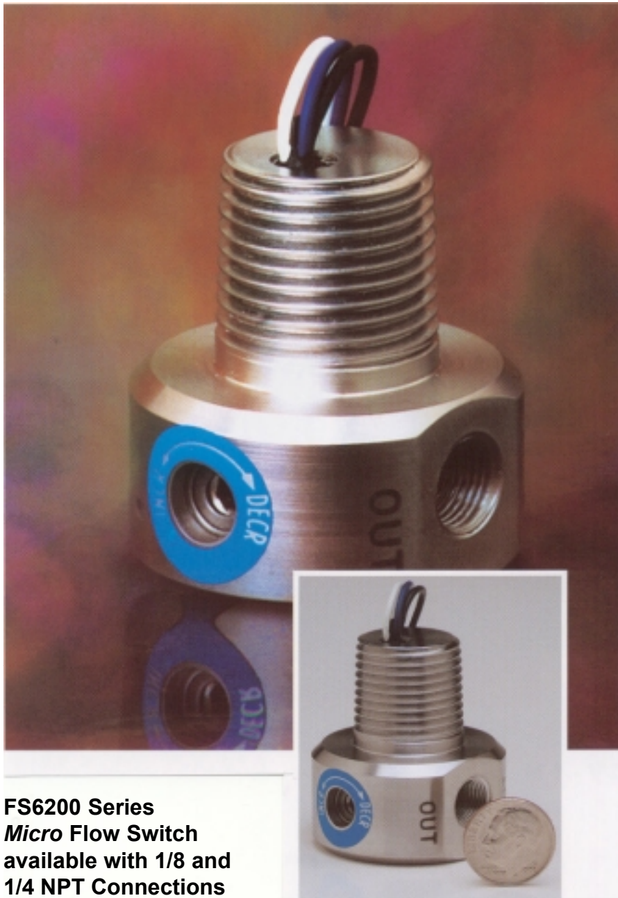
FS6200 Series Micro Flow Switch available with 1/8 and 1/4 NPT Connections

Adjustable Gas Series - Range 30 sccm to 20 slpm